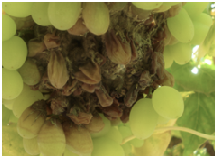
▲ Economically important phytopathogenic fungal controller compounds could be identified